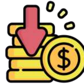
Price decay and eventual 100% loss in options