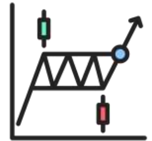
Option controls keep stocks range bound