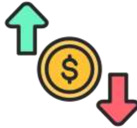
Heavy mark to market